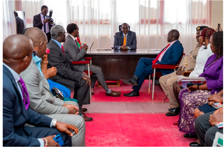
Hon. Julius Migos Ogamba, Cabinet Secretary, Ministry of Education, chatting with the Laikipia University Council Members and H.E Joshua Irungu, Governor, Laikipia County

However, he noted that 23 public universities have gone bankrupt due to financial challenges, which compelled the government to unveil the New Funding Model (NFM). NFM addresses universities' financial challenges by funding students according to their needs and programme costs. He reiterated that the government is still fine-tuning the model to make it more effective and accommodative to every student.