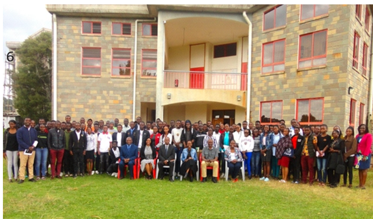
Group photo for trainer and trainees