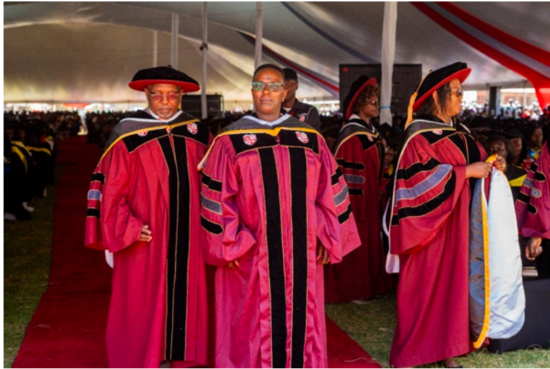
PhD Graduate and Supervisors during the Laikipia University's 12 th Graduation Ceremony