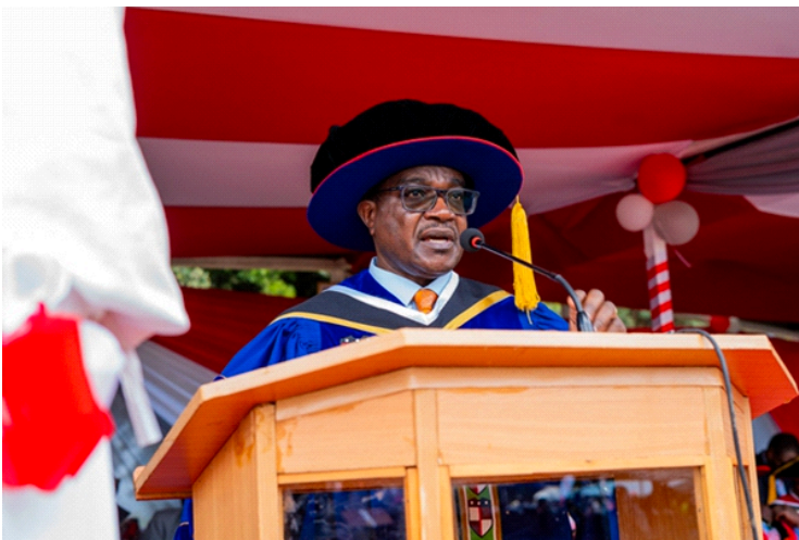
Hon. Julius Migos Ogamba, Cabinet Secretary, Ministry of Education, addressing grandaunts