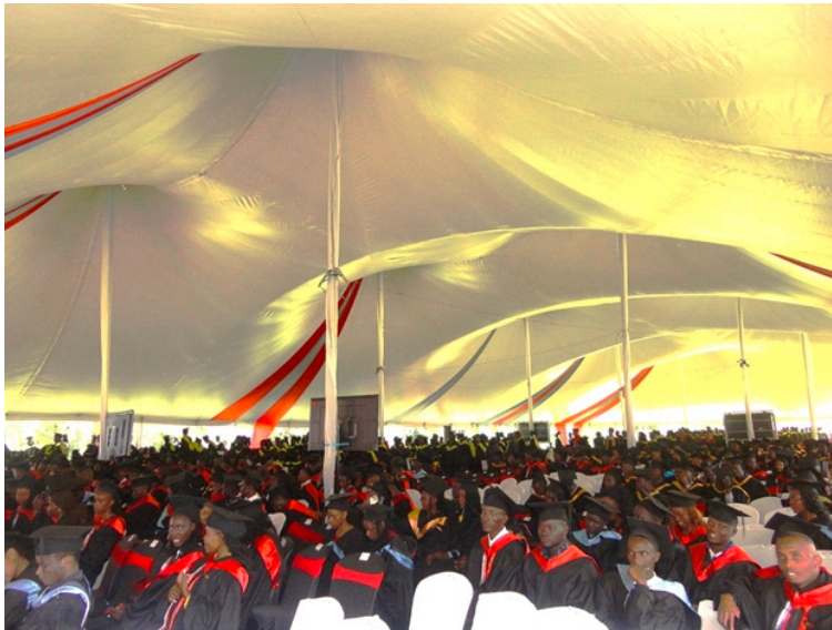
Graduates during the Laikipia University's 12 th Graduation Ceremony