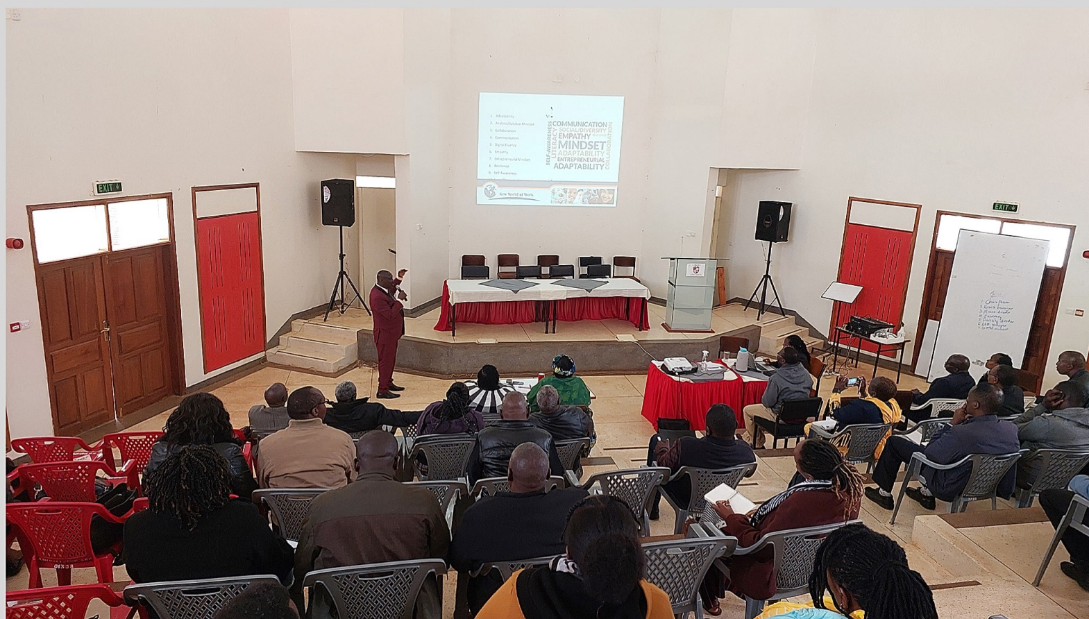
A section of participants during the Competency Based Curriculum (CBC) training held at Mandela Hall on 5 th May, 2023.

The main aim of the training was to acquaint the staff with how the CBC for University Education works. It touched on key areas in its execution, major difference between Knowledge Based Curriculum (KBC) - the current curriculum and the Competency Based Curriculum, Core Competencies for basic Education and Implications of Basic Education Curriculum Framework (BECF). Flexibility with earlier career placement, emphasis on values and guiding principles were among the importance of CBC. The University is looking forward to put in place all measures that will ensure, with time CBC is inculcated in the Curriculum.