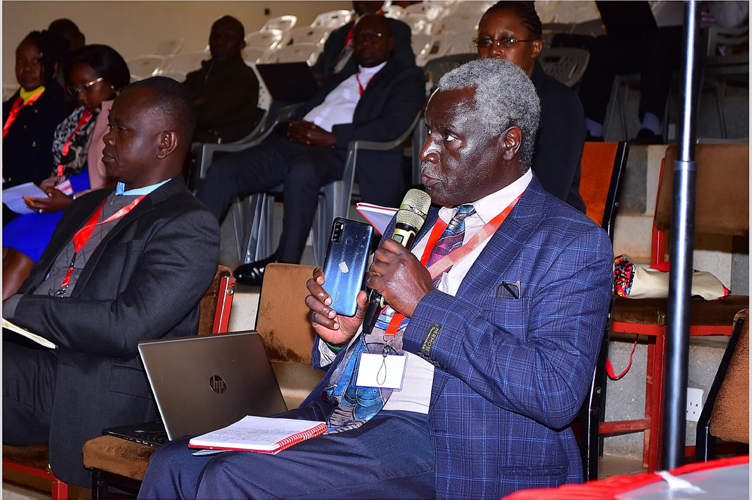
Laikipia University Vice Chancellor making his contribution during the 5 th Biennial Conference held at Mandela Hall from 24 th - 26 th May, 2023.