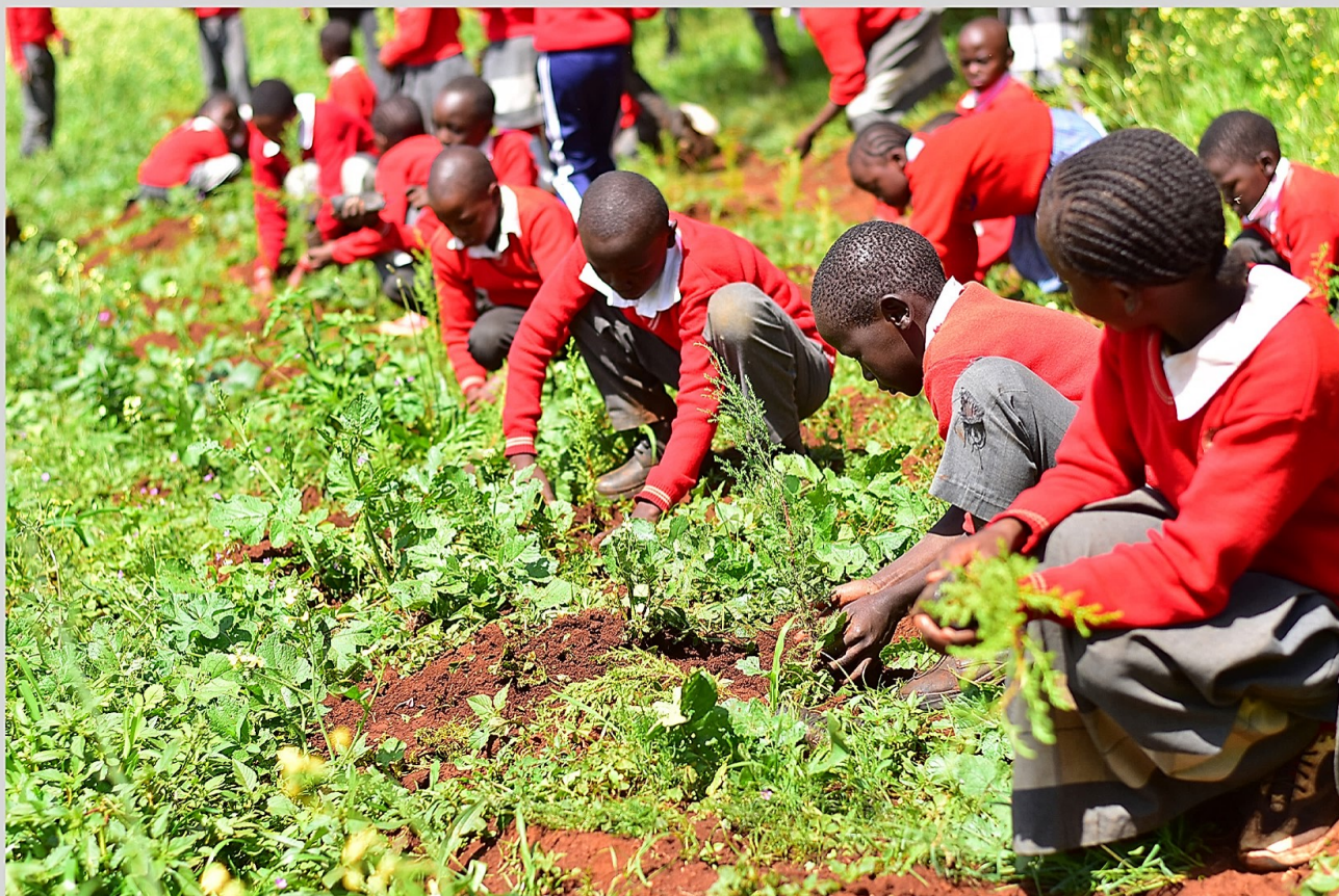
Some of the pupils from Laikipia Campus Primary School planting trees during the Environmental Week held between 12 th - 17 th June, 2023 at the University.

This year the ESC managed to plant more 5000 trees and donated 1000 tree seedlings to the surrounding communities and select institutions. Seedlings were donated to surrounding community including; Laikipia University Catholic Chapel, Laikipia Campus Primary School, Igwamiti Primary School and the Daring Eagles CBO. Following the successful tree planting partnership, the institutions and CBOs have promised to work with Laikipia University in future to ensure increased tree seedling production, increased forest cover in Laikipia County as well as increased environmental integrity awareness within the county.