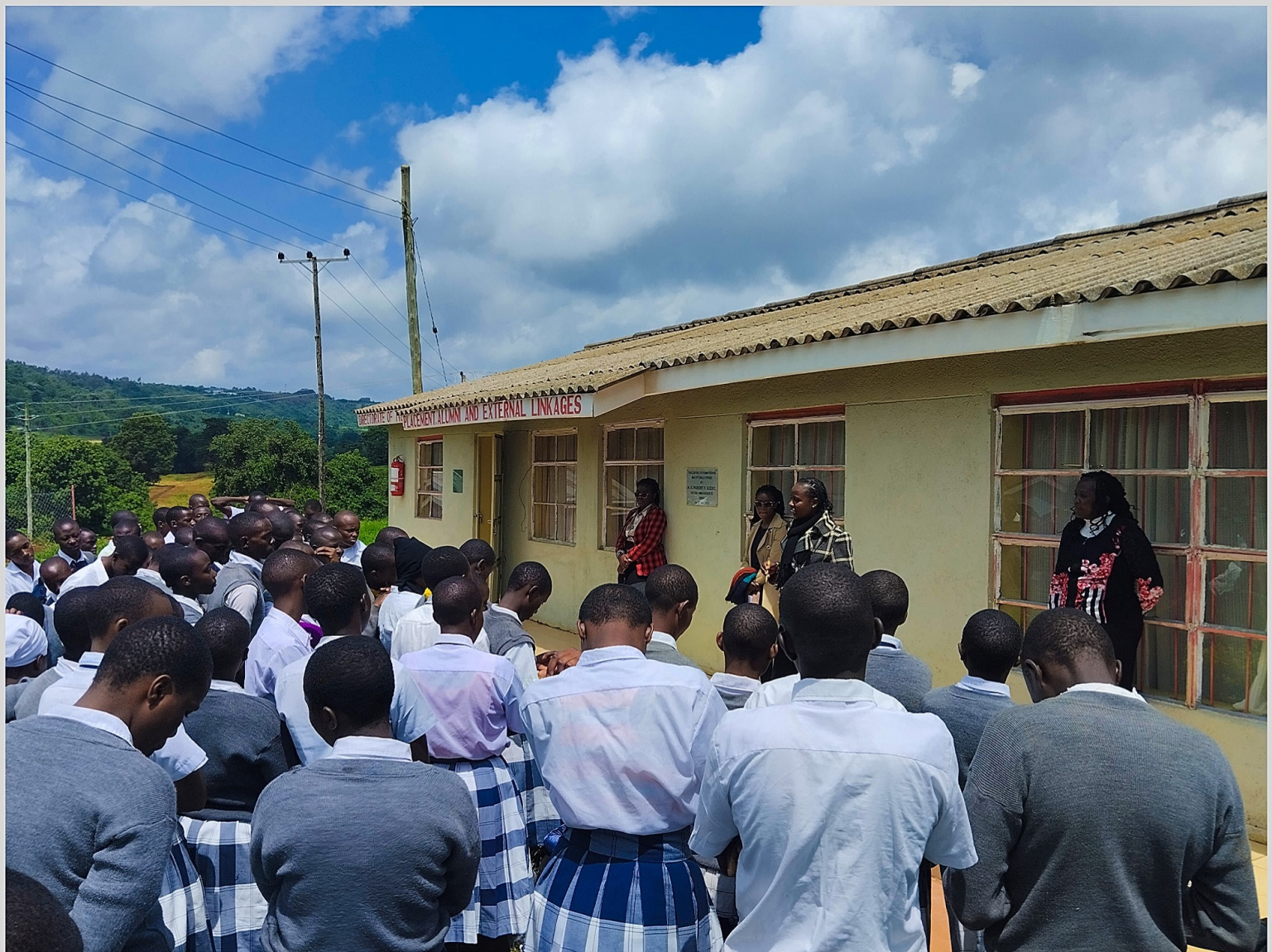
Member representatives from the Directorate of TVET, Career Placement, Alumni and External Linkages interacting with students from Gilgil Garrison Day Secondary School on 26 th June, 2023.

At the farm, students were informed on livestock production i.e. in poultry, pigs, sheep and dairy section. In the library, they were taken around sections that are there from the Cataloguing area, Africana, Achives among others. The students were happy and motivated enough to study hard and smart so as to get grades that will enable them secure a chance to join University like Laikipia to pursue the course of their dreams.