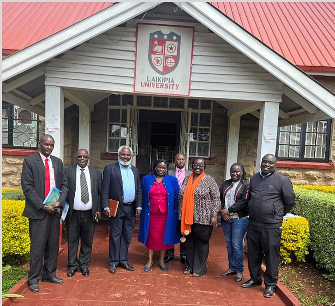
Members of the Laikipia University Management Board together with officials from the Ministry of Education outside the University Administration block during the visit on 7 th June, 2023.