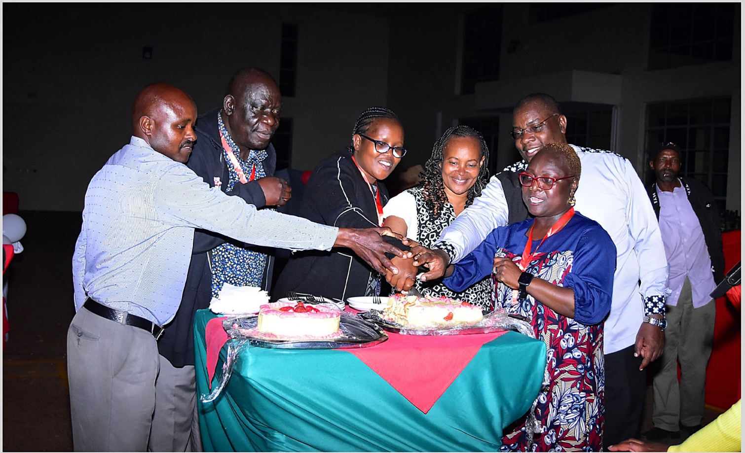
Some of the conference delegates cutting the cake during the cocktail party held at Vision 2030 Hall on 24 th May, 2023 as part of the Conference activity.