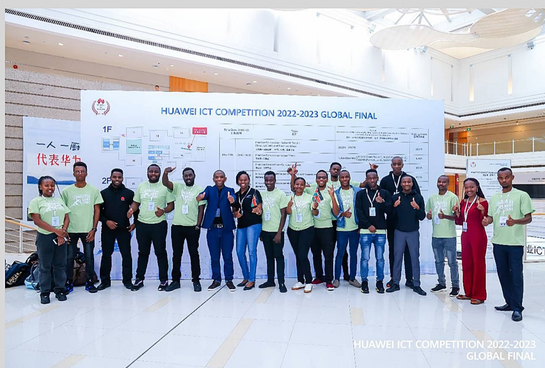
A team of students representing Kenya posing for a photo during the Global Huawei ICT Competition 2022 - 2023 Final held in China.