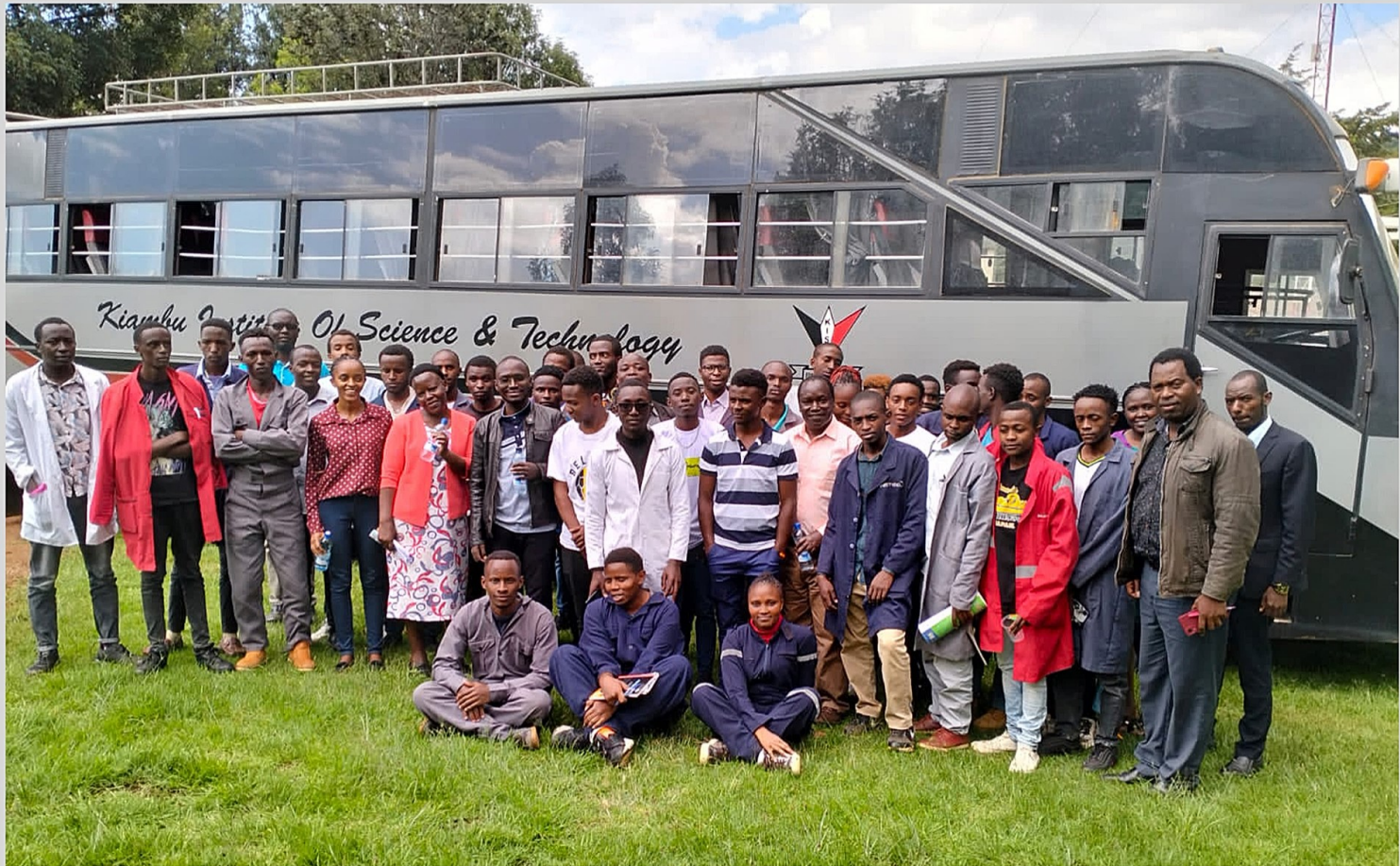
Members from the Directorate of TVET, Career Placement, Alumni and External Linkages with students from Kiambu Institute of Science and Technology who visited the University on 16 th May, 2023.