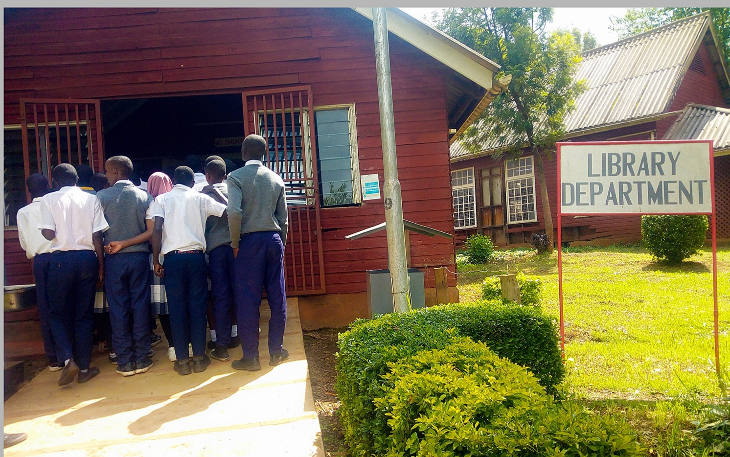
A section of students from Gilgil Garrison Day Secondary having a tour of the library during their Mentorship Forum visit to the University on 26 th June, 2023.