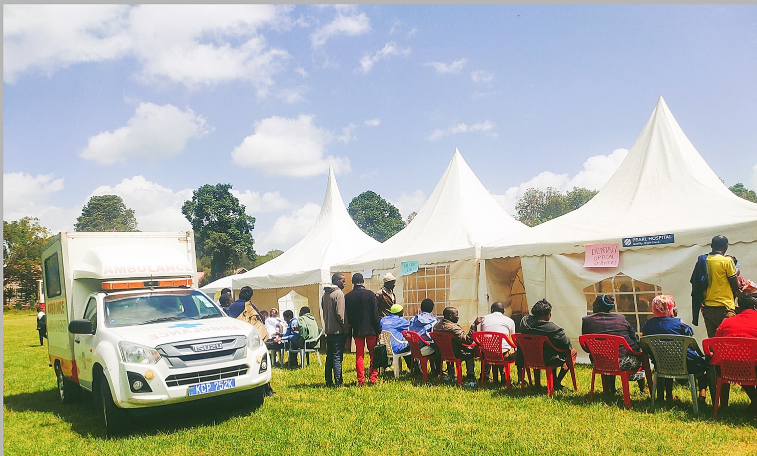
Participants waiting to be attended at the optical and dental service points during the Health Week exercise carried out at the University from 20 th - 21 st June, 2023.