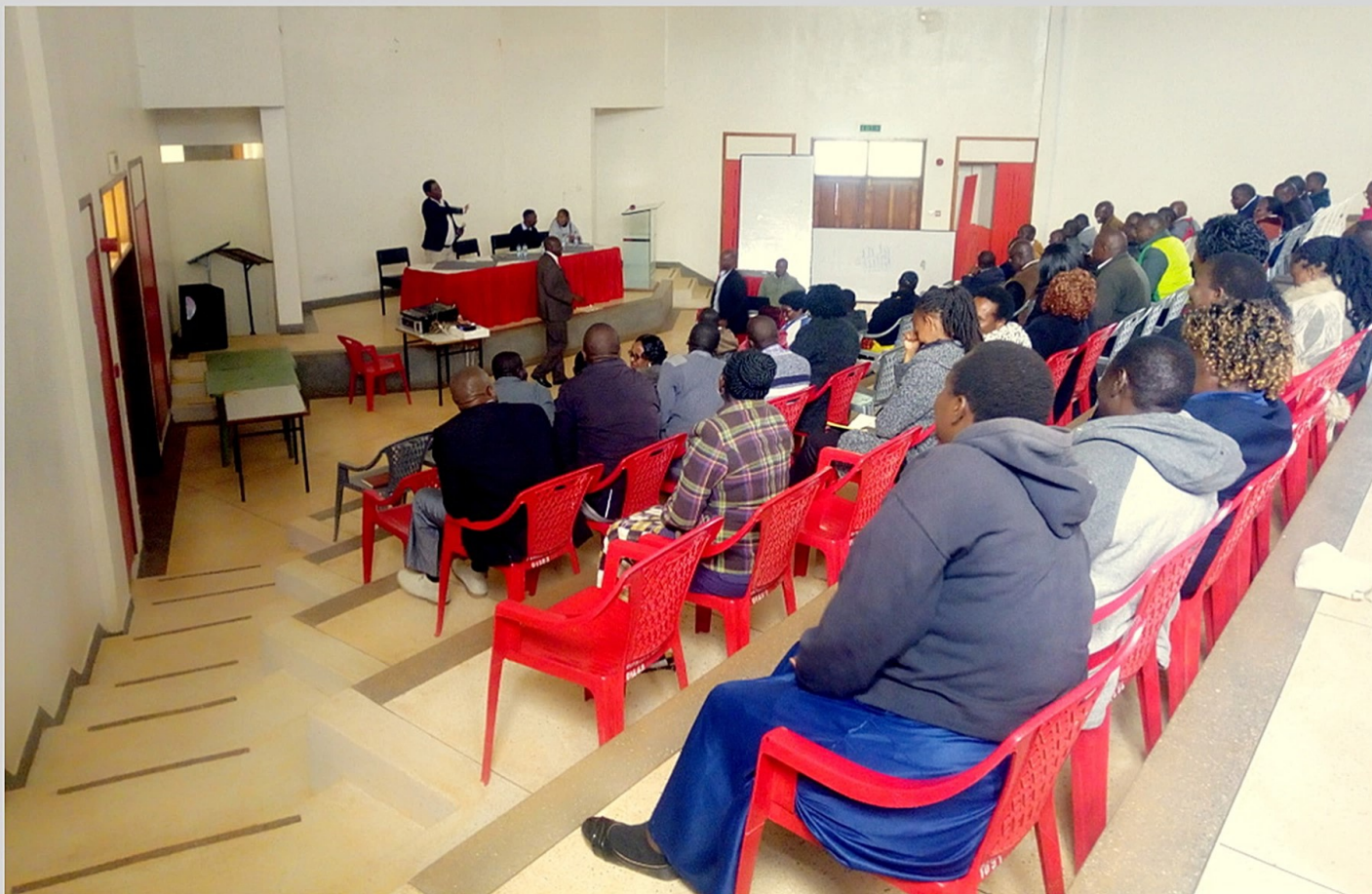
A section of participants during Laikipia University Health Talk held on 13 th June, 2023 at Mandela Hall.

The theme for this year's Health Week will be: Understanding Non-Communicable Diseases (NCDS) For Better Health. Everyone is welcomed and encouraged to take part including staff, students and the community at large.