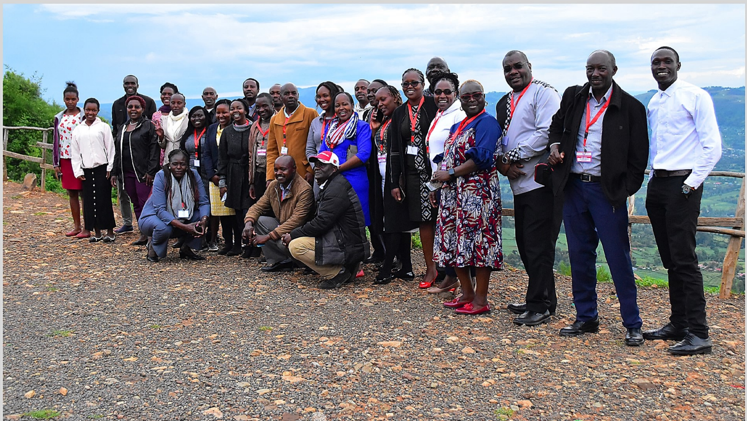
Conference delegates at an excursion session at Subukia View Point on 24 th May, 2023.