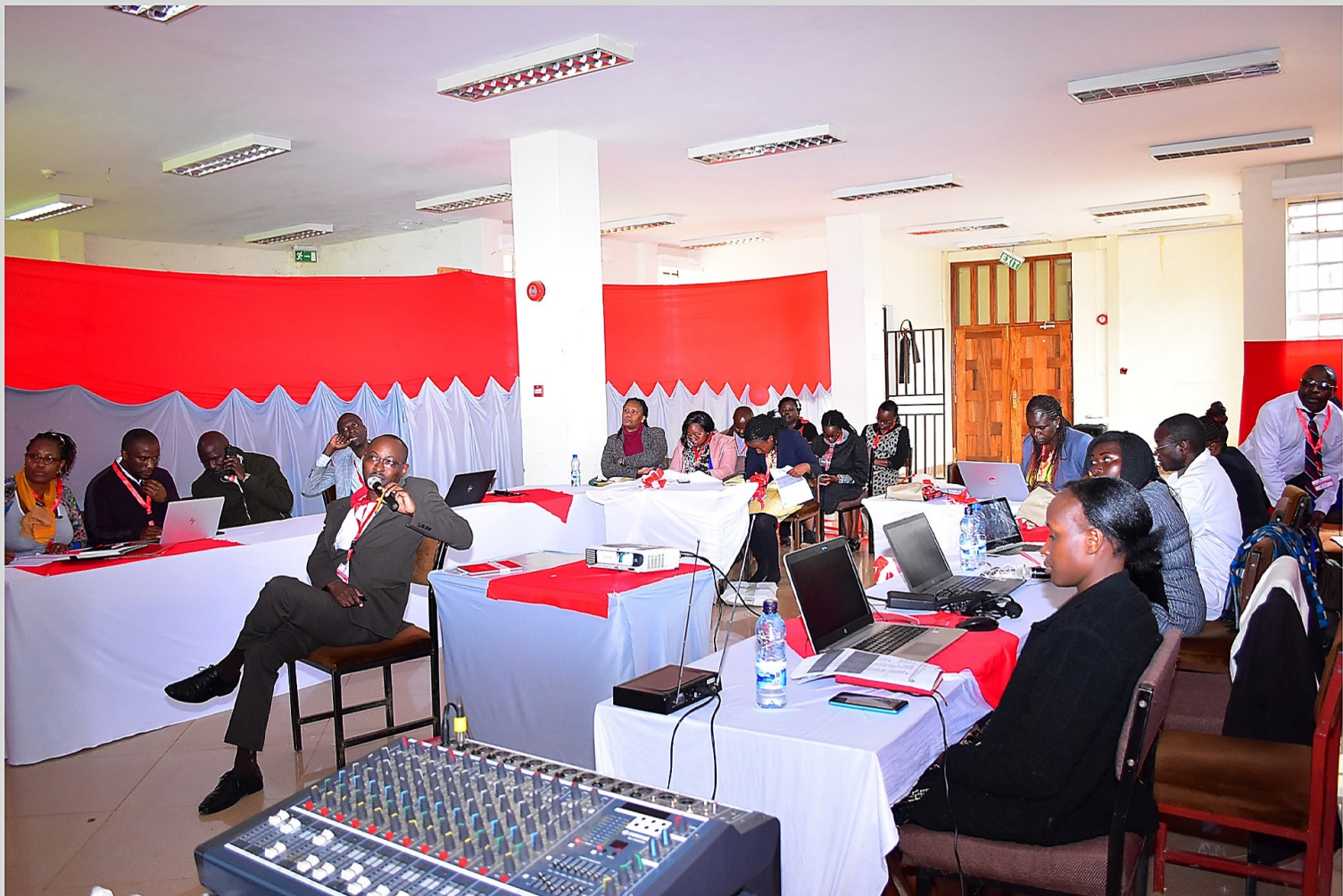
A session in progress during the 5 th Laikipia University Biennial Conference held concurrently at Humanities and Development Studies Boardroom on 25 th May, 2023.