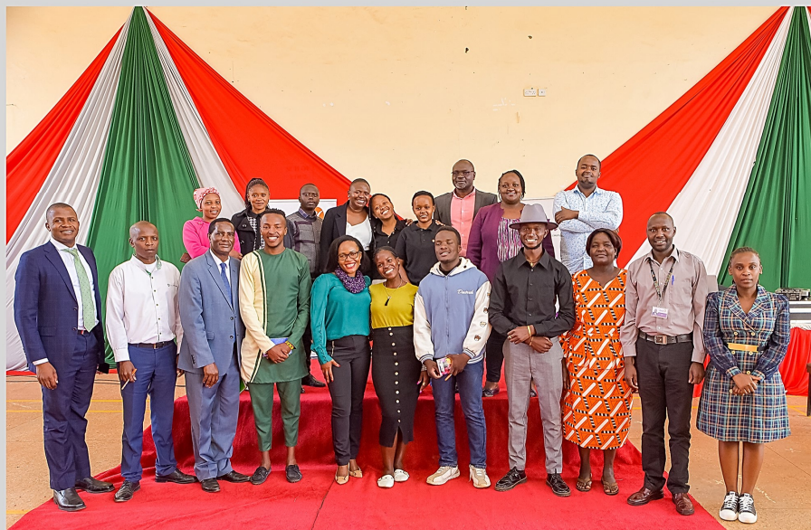
Officials from Old Mutual and Faulu Bank, Laikipia University staff and students pose for a photo after the Mentorship Forum at Vision 2030 Hall on 29 th September, 2023.