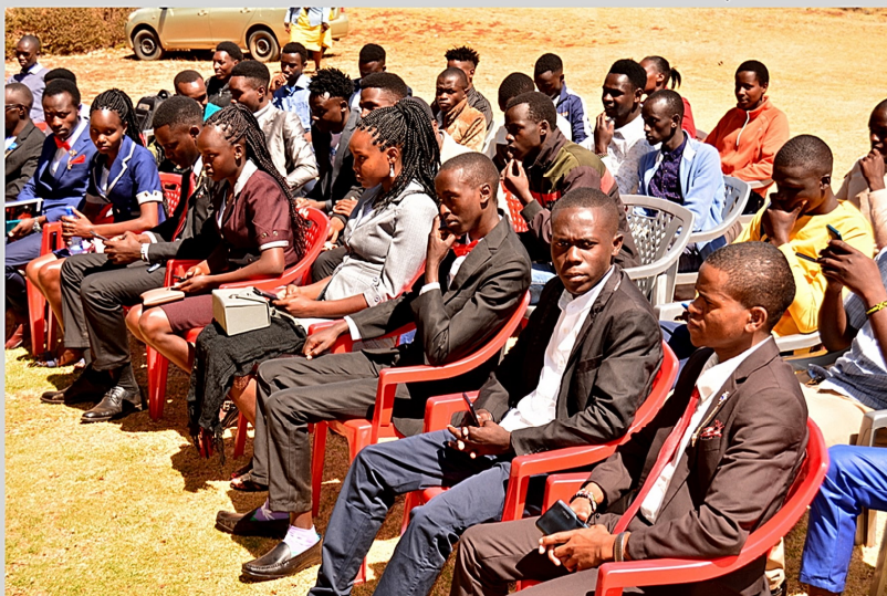
Student leaders at a past event. A section of student leaders during their swearing in ceremony held on 23 rd February, 2023 outside Mandela Hall.

Each student leader gave a summary of what they achieved from the training and what they planned to achieve in the remaining period of their term. They thanked the University Management for organizing the leaders training and promised to work as a team and in collaboration with University leadership for the benefit of students and that of the entire University.