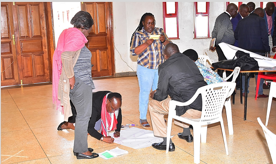
Participants executing a group work exercise during the CBC Training for Lecturers held on 22 nd - 24 th August, 2023 at Mandela Hall.