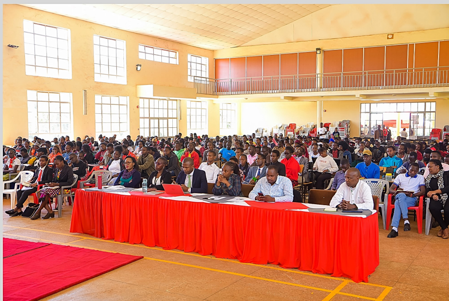
A session in progress during the Mentorship Forum.