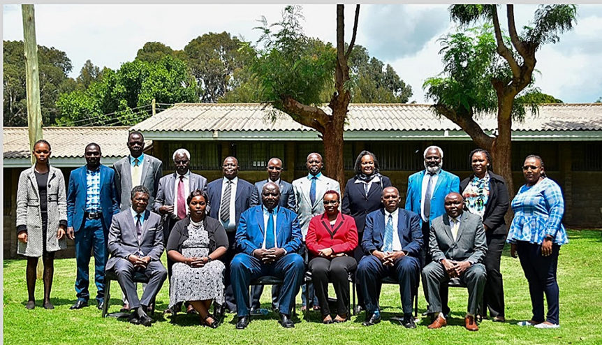
Laikipia University Members of the University Management Board together with the new Council Members posing for a photo outside University Management Boardroom during Council Members visit on 21 st July, 2023.

After the meeting, the members had a tour to the ongoing construction sites at Science Complex building at Gate A, New Administration Block and the New Library. They also visited the Farm Department where they toured sections like the ongoing construction at the zero grazing unit, the poultry section, pigs, sheep and dairy. We wish them well as they deliver their mandate and we look forward to an improved Laikipia under their tenures as new University Council members.