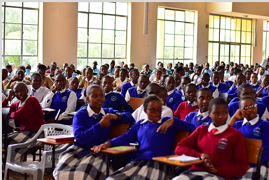
A section of students from various Secondary Schools within Laikipia County following proceedings during the Laikipia County Secondary Schools Career Mentorship forum held on 15 th September, 2023 at Vision 2030 Hall.