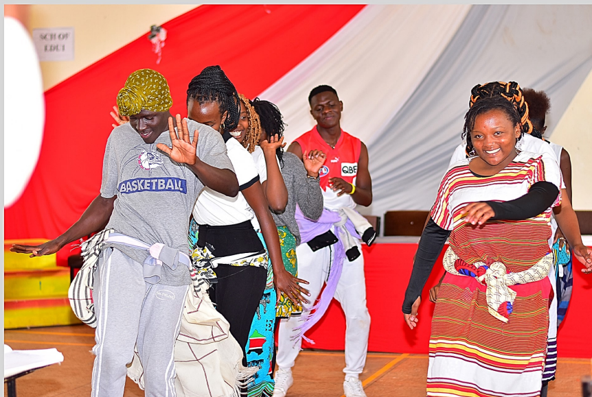
Laikipia University Travelling Theatre members performing during the Laikipia County Secondary School Career Mentorship forum held at Vision 2030 Hall on 15 th September, 2023.

The students had interactive session with Kenya Institute for Public Policy Research and Analysis (KIPPRA) Mentors, Laikipia University Travelling Theatre members as they entertained them through moving performances. The students also had a chance to showcase their talents.