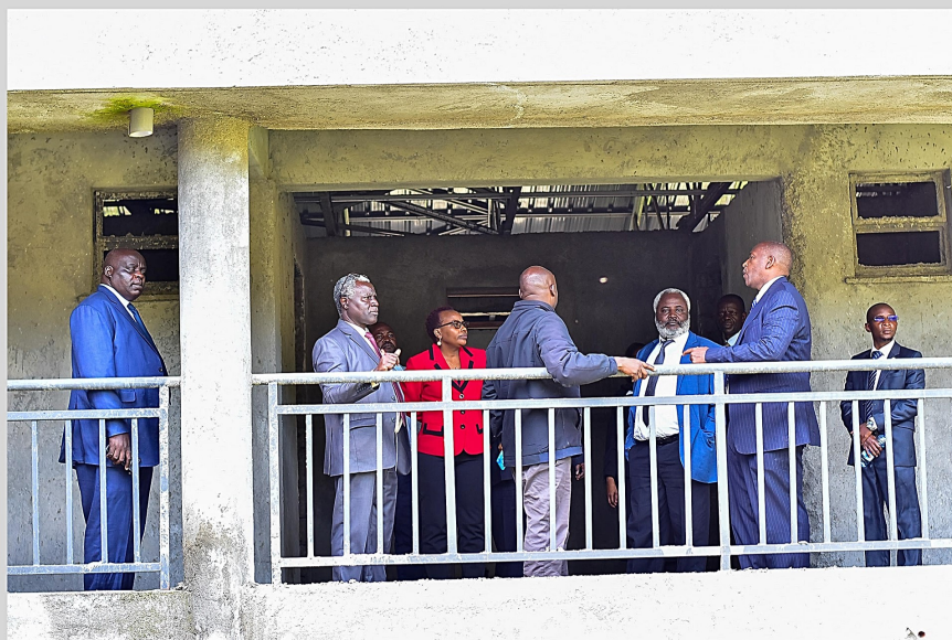
Members of the University Management and the new Council members on the on-going construction of the Science Complex at Gate A on 21 st July, 2023.