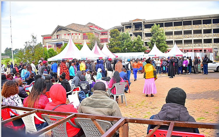
First Year students 2023/24 and their parents receiving directions on how to go about the registration process during the Reporting and Registration of First Year students on 7 th October, 2023 outside Vision 2023 Hall.

All students were admitted irrespective of whether they had paid/cleared fees or not. Therefore, students were advised to turn up in large numbers for the registration exercise. Orientation exercise commenced on Tuesday, 12 th September, 2023 and students were expected to attend all the sessions without fail. During the orientation students were informed on the process of inter-faculty and inter-programme transfer procedures and timelines.