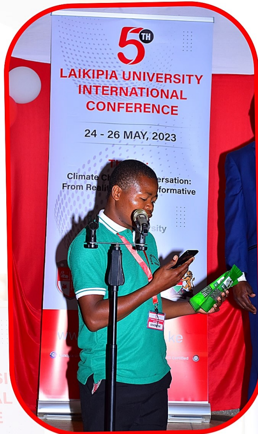
One of the participants making his presentation during the Conference.