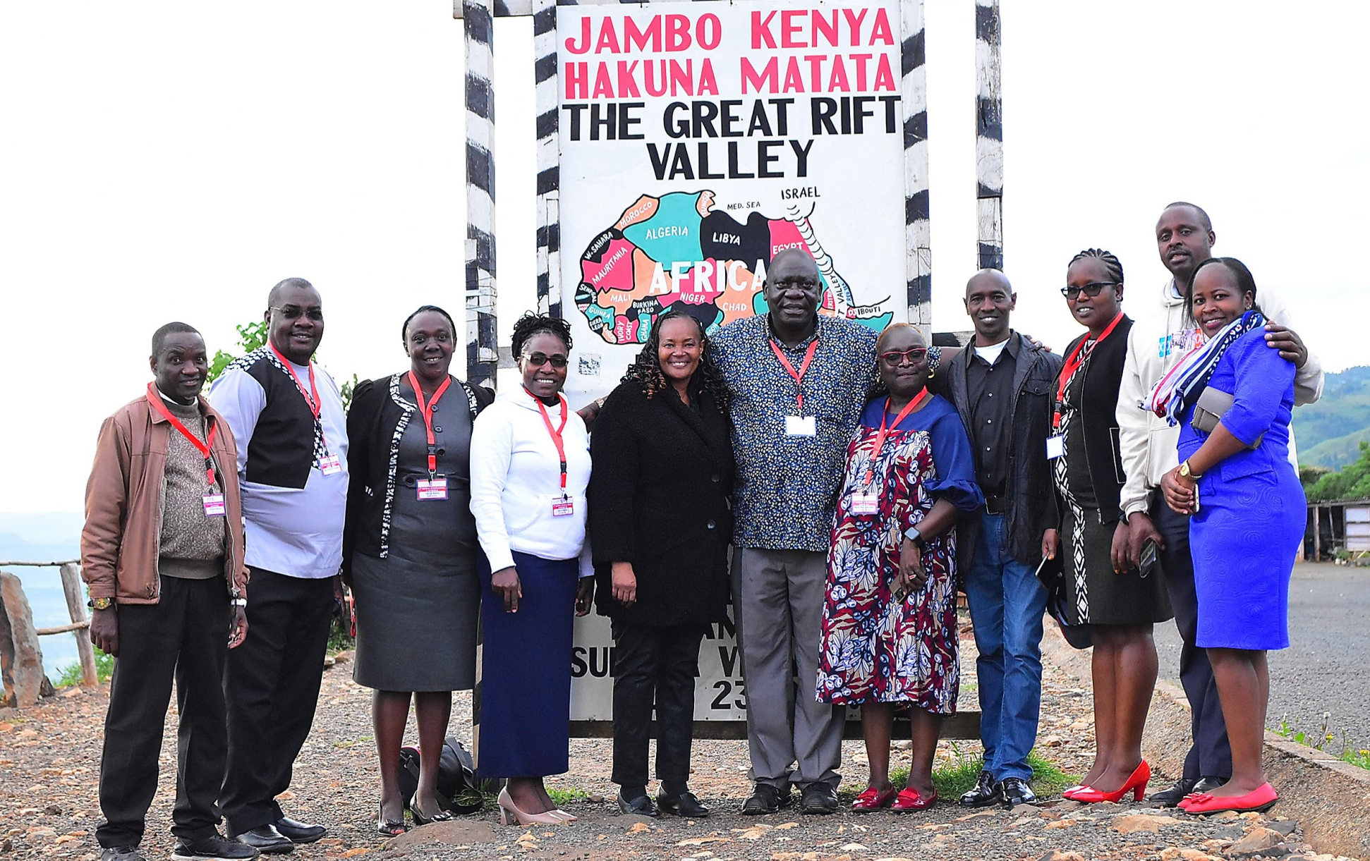
Some of the delegates and participants during an exclusive excursion at Subukia Great Rift Valley view point.