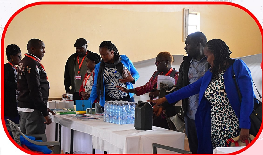
Some of the participants at an exhibition point stationed at Vision 2030 Hall.