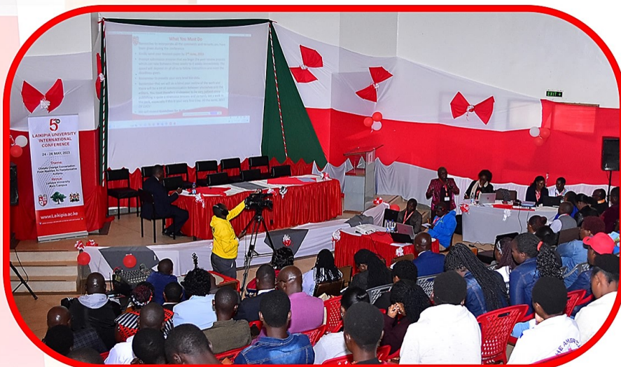
A section of participants following the proceedings during the Conference.